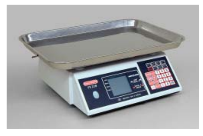
above: optional produce/fish tray left: optional customer tower